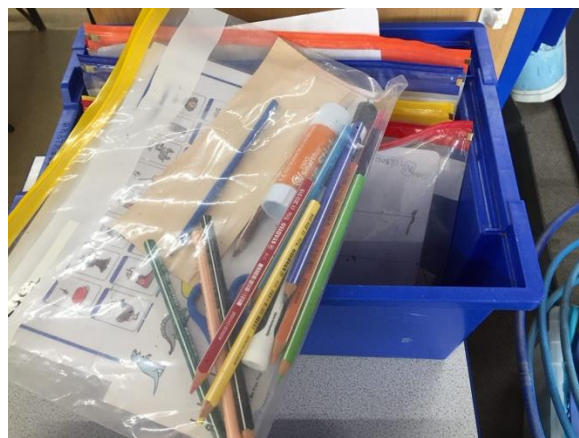
Butterfly Class Resource Pack

You will be given resources like pencils, glue sticks and scissors that are just for you to use and are not for sharing. Your teacher will decide what will go in your pack. This is to help keep you safe.