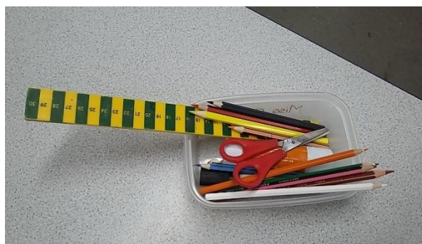
Year 1 Resource Pack

You will be given resources like pencils/pens/whiteboards/rulers that are just for you to use and not for sharing. Your teacher will decide what will go in your pack. This is to help keep you safe.