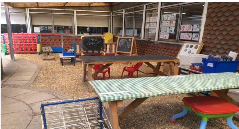
The outdoor classroom

We will also be using the outdoor classroom a lot more. There will be a maximum of 2 children using one area at a time and we won't be sharing toys and resources as much as we used to.